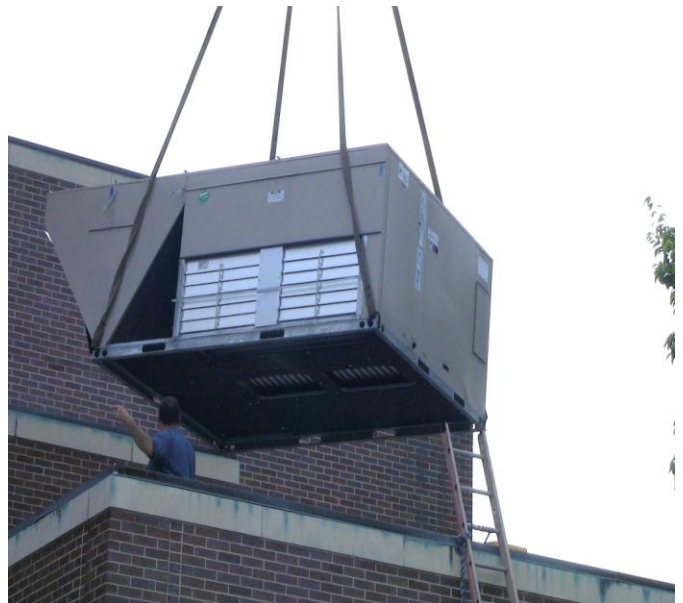
Ah! Warm winters & cool summers