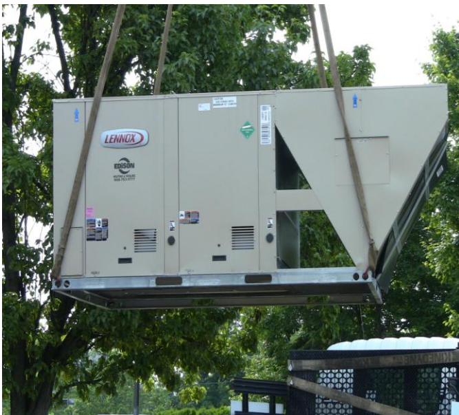
In with the new