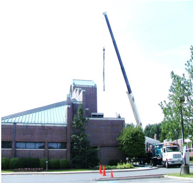
Heavy equipment needed for this job