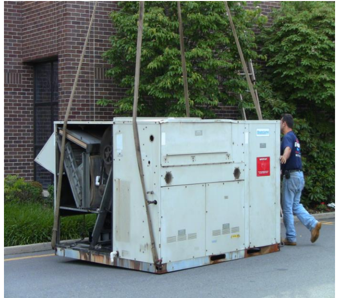
Out with the old